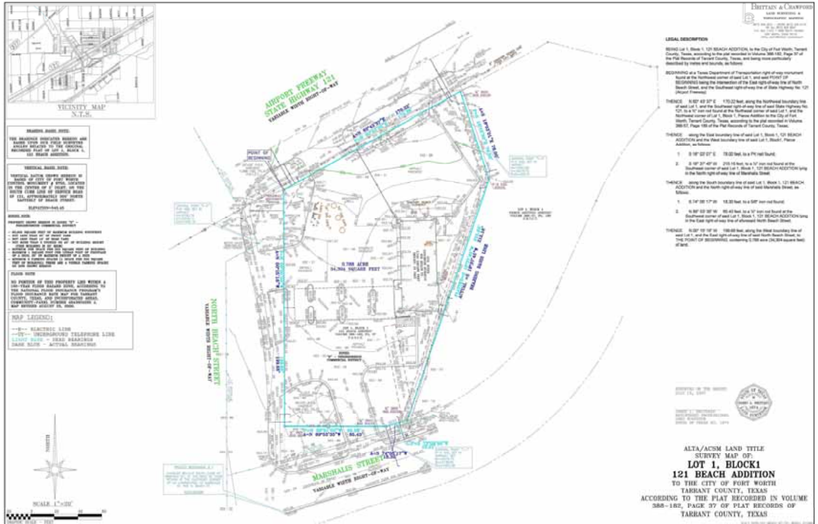
Demographics: 2007 Estimates & 2012 Projections